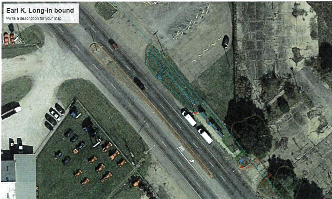
Earl K. Long-In bound